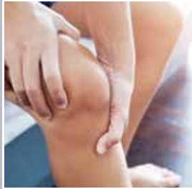
Gout, feeling heaviness