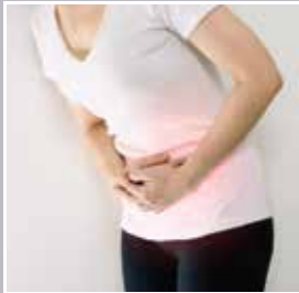
Menstrual disorders, low menstrual flow