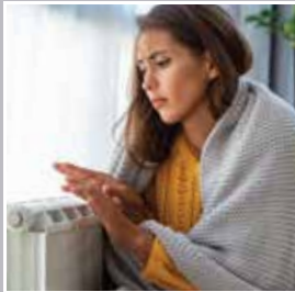
Night sweats, fatigue, low body temperature, limp coldness